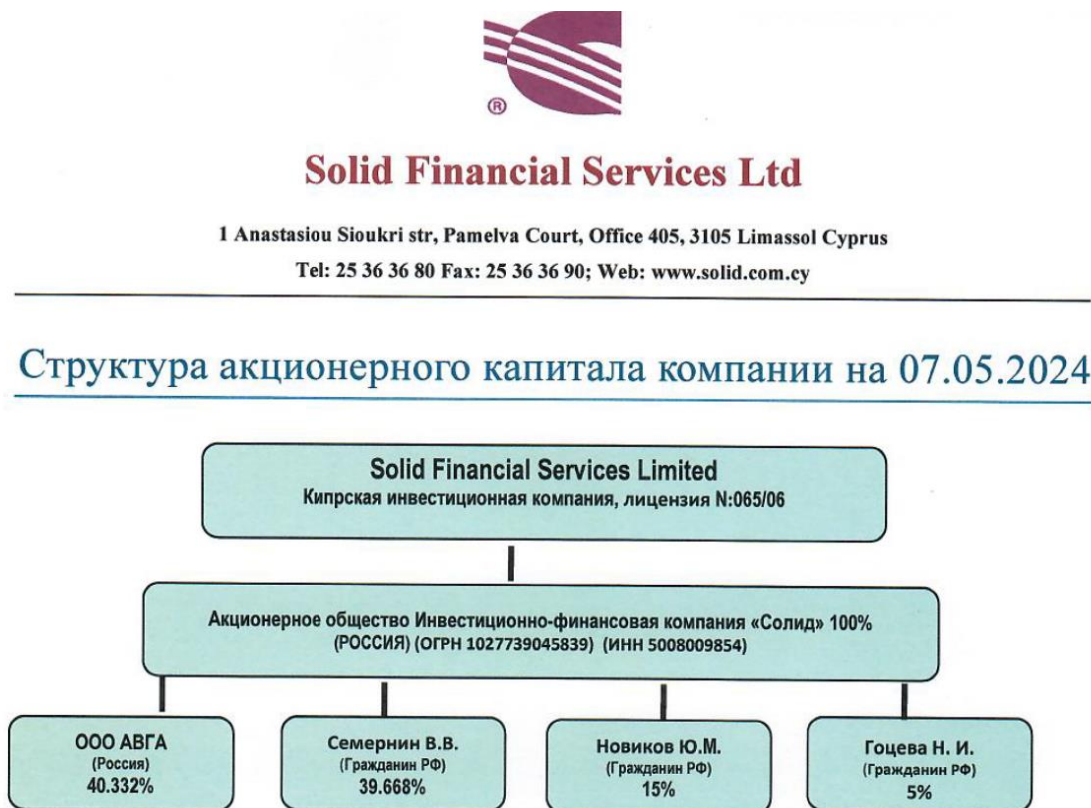
Figure 1: Organizational Structure